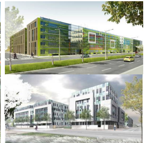
Lazard Groupe / Archigroup